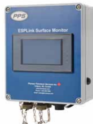
Touch System (ST)

ESP Downhole Gauges are available in three specifications: