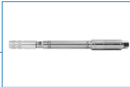
PCPLink Dual Pressure Gauge